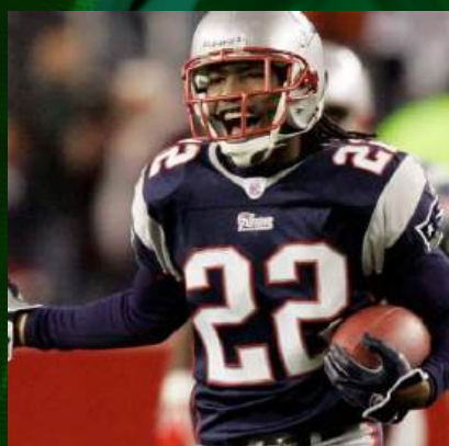
Asante Samuel Sr.